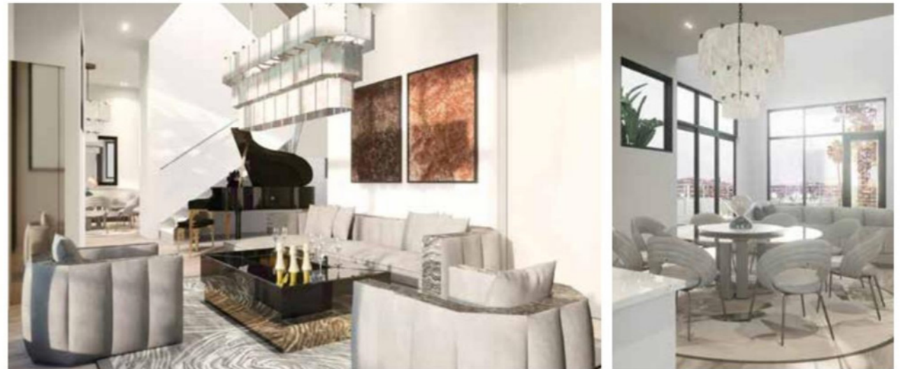
Each distinct property come fully equipped by Visionnaire with the latest in sophisticated, sustainable style